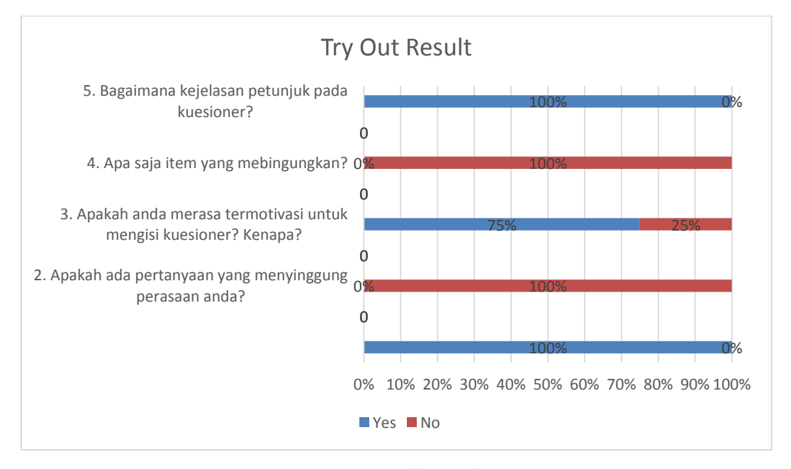
Table 3.3 Result of Try Out

The try out result showed that there was no necessary change to be made in the tools of data collection. The student involved in this try out reported that there were no confusing items and the instruction was all clear. There was no offensive items that they found in the tools. However, they reported that 25% of the students felt less motivated to complete the data because it takes time to complete. The recommended time for the students to complete all data from the tools are between 10 and 30 minutes.