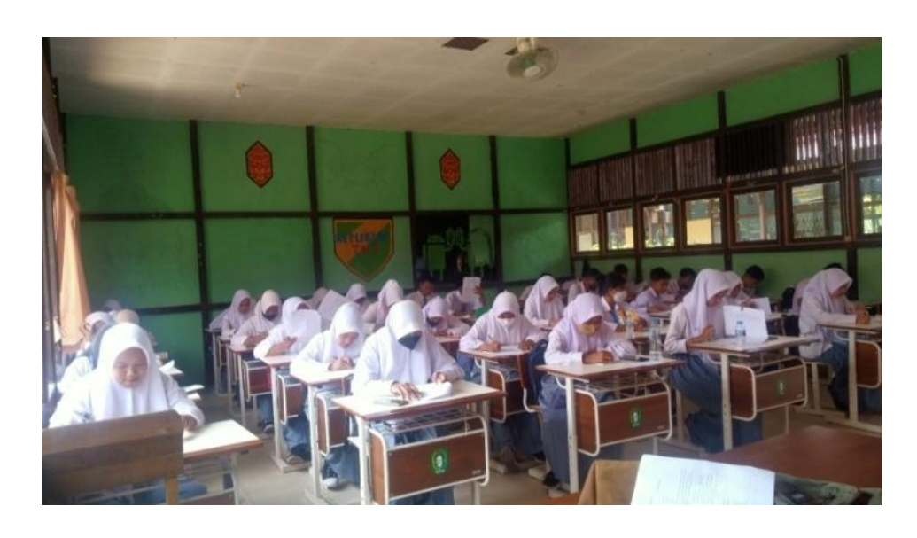
Students' activity in doing Questionnaire